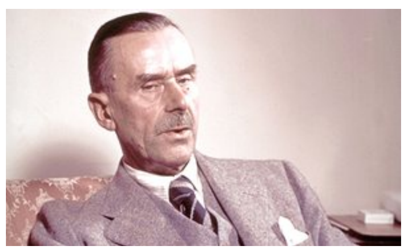
Adorno's co-author ... Thomas Mann.

An autobiographical novel with slapstick movie passages straight out of Chaplin and a bitterly ironic sense of the world, related by an outsider from a lost generation. In bleakly comic form it presents the contemporary fragmentation of the human body and the loss of individuality in mass society. Available only in German.